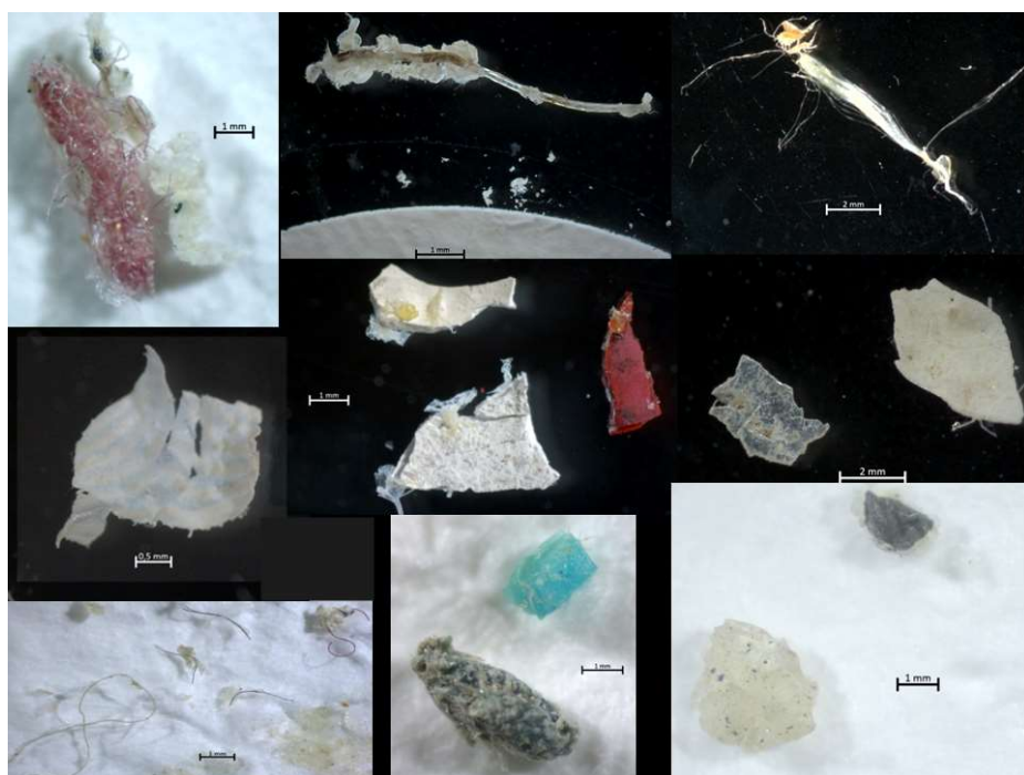
Figure 1. Photographs of different types of MPs collected in seawater in Ría de Vigo, NW Spain.

MPs are heterogeneous, exhibiting a range of shapes or morphologies from spherical beads to angular fragments and long fibres (Fig. 1). According to their origin, MPs are either primary or secondary. Primary MPs have been specifically manufactured with their size and include virgin plastic pellets used as raw materials for the fabrication of different products (Browne et al. 2011; Fendall and Sewell 2009; GESAMP 2019). According to GESAMP, secondary MPs “ result from wear and tear or fragmentation of larger objects ” (GESAMP 2019). The shape of plastic fragments is relevant because it determines drag, the viscous force exerted by a flowing fluid on any submerged particle that governs its terminal settling velocity and, therefore, the time a particle is being transported by water or air. Besides, and concerning the smaller sizes, particle shape influences suspension stability (Kim et al. 2015).