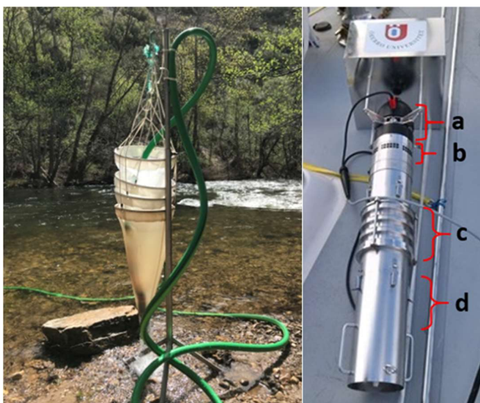
Figure 3. Example of sampling in a river with a battery of nets with different mesh size fed by a pump with known water flow. In situ pump built by KC Denmark (Silkeborg, Denmark) and EU CleanSea project; a: Faulhaber Swiss motor system, 3863H0224CR – 24V, GB 150 nm with a planetary gearing 44/1 – 4,8:1 16 nm; b: Water inlet with rotating blades to pull in the surrounding water; c: stack of filters with inserted 500 \mu\text{m} , 300 \mu\text{m} and 50 \mu\text{m} filters; d: water outlet and flow meter (right)